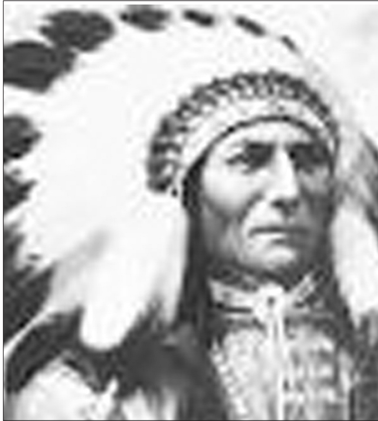
Crazy Horse